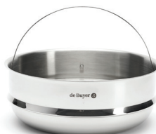
• Stainless steel steamcooker 10-367524 / Ø 24 cm