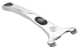
• Removable handle 10-366000