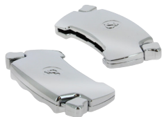
• Set of 2 removable lockable metal handles 10-366003